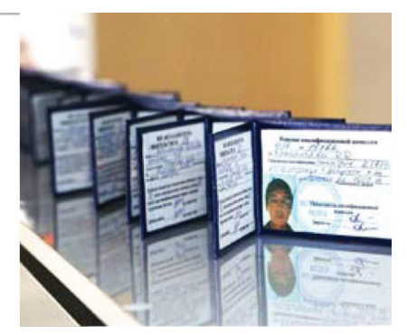
Photo 6: Diploma received by graduates of the training on Electrician