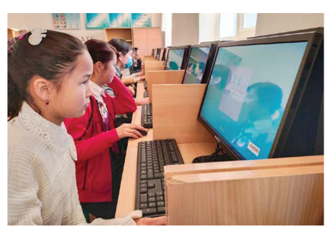
Photos 26, 27: Schoolchildren of # 17 school in Ali aul, Muynak have access to internet and digital education