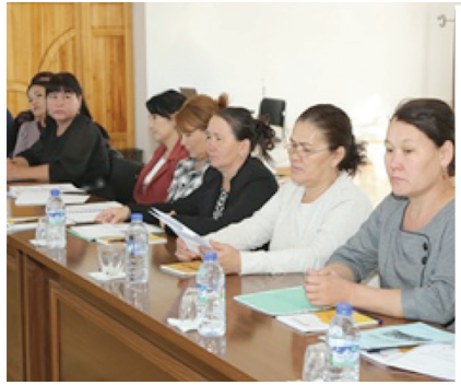
Photos 10, 11: Rural women of Bozatau, Kungrad and Muynak in training.