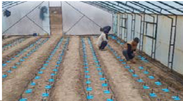
Photos 21, 22: Demo plot on testing "Buried Diffuser" water saving technoloy in IICAS