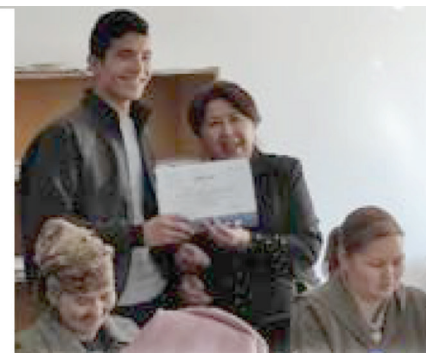
Photos 13, 14, 15: Beneficiaries of pilot dsitricts are otainining knowledge and skills in efficient agriculture practices