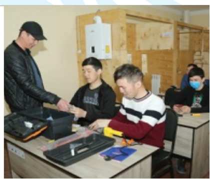
Photos 1, 2, 3. Youth and women trainings in five professional spheres on the basis of established three mono-vocational training centers