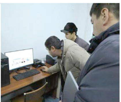
Photos 33, 34, 35: Electronic polyclinic platform, rural residents have access to digitalized medical services in Bozatau district