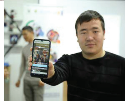
Photos 28, 29, 30: Free Wi-Fi zones (15 communities) in Bozatau, Kungrad and Muynak districts