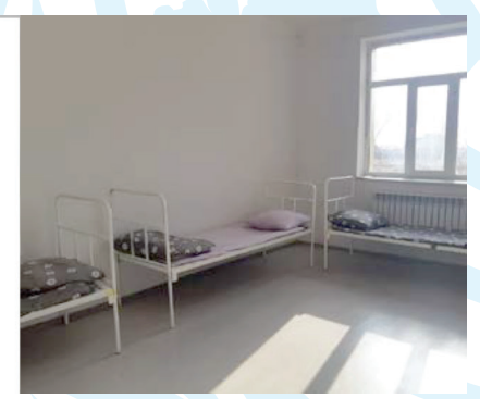
Photos 36, 37, 38: Rural healthcare facility in Kazakhadarya VCC of Muynak. People have access to improved healthcare services